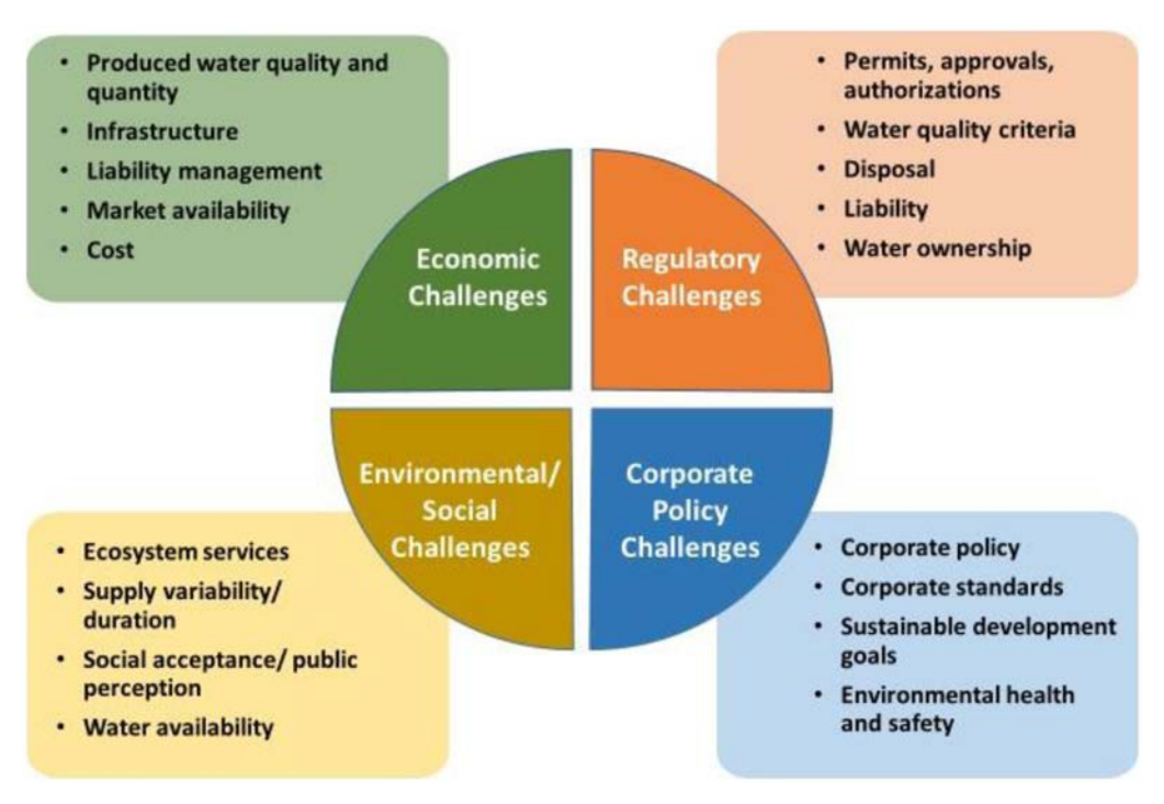
Figure 4—Challenges to reuse of produced water outside of oilfield operations.

Understanding the nature and composition of the produced water source is a first step for assessing the environmental, health, and regulatory issues associated with reuse outside of the oil and gas operations, as well as the feasibility of rendering the water suitable for the proposed use. The technical and economic feasibility of rendering the water suitable and safe for the proposed use will commonly dictate whether the opportunity warrants further consideration. In addition regulatory challenges to reuse of produced water for off-site, non-oilfield applications include restrictions on storage and transport, water quality criteria endpoints and the need to obtain permits, approvals or authorizations from local, regional, and/or national governing authorities. Water ownership can also pose an impediment to reuse for off-site non-oilfield applications as the rights of ownership, diversion and use of the water may belong to the government, landowners or other parties and not the oil and gas operator. Additional potential issues associated with non-oilfield reuse must also be considered, such as accidental releases, overflows, leaching or runoff that may pose risks to ecosystems, contamination of industrial or commercial water supplies, problems with respect to water quantity or quality (PTAC, 2007).