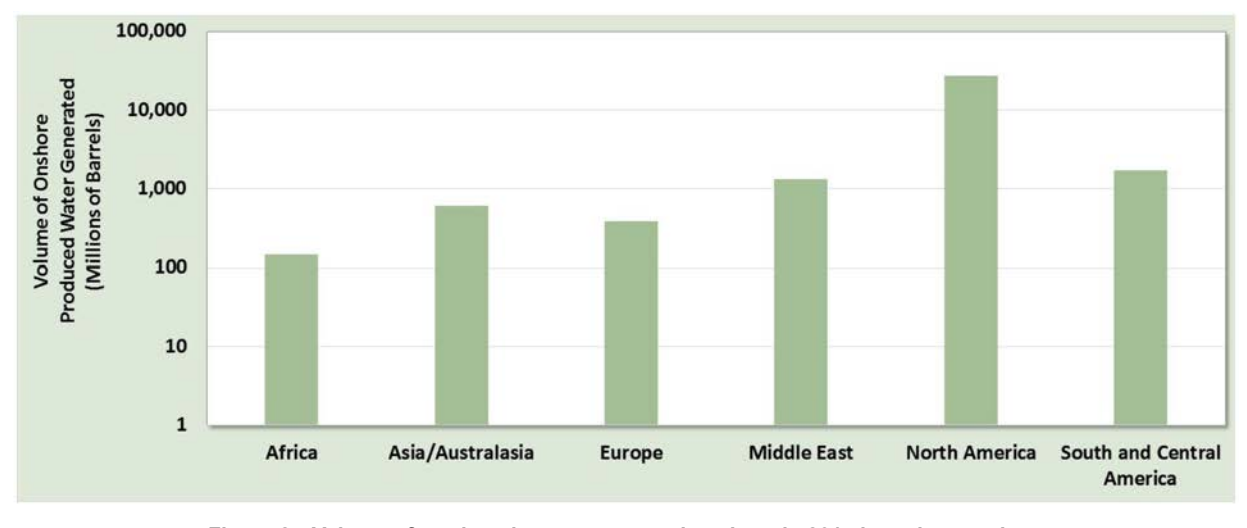
Figure 2—Volume of produced water generated onshore in 2017 in various regions around the world as reported by IOGP members (Data extracted from; IOGP, 2018).

The onshore oil and gas industry generates millions of barrels per day of produced water worldwide (IOGP, 2018). Quantities of produced water generated can vary across regions. For example, Figure 2 presents the volume of onshore produced water reported by 44 of the 56 International Association of Oil and Gas Producers (IOGP) member companies operating in various regions worldwide during the 2017 reporting period. These data represent approximately 27% of 2017 world production, and as such do not encompass all operations in these regions, but provide a general sense of the magnitude of the produced water volumes generated in each case.